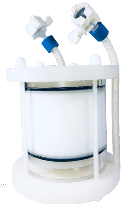
1.5L Column Volume (100mm ID x 200mm BH)